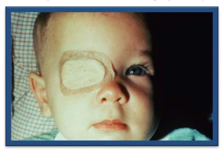
Baby with Eye Patch for Amblyopia Treatment

It is not uncommon for children with accommodative esotropia to have amblyopia or decreased vision in one eye (usually the eye that does most or all of the crossing and often the eye with the larger refractive error). If there is significant amblyopia, Dr. Shin will recommend patching the stronger eye or administering atropine eye drops (with or without a fogging lens) to blur the stronger eye and force the child to use and strengthen the eye with amblyopia. The patching and eyedrop/fogging lens regimen stimulate the brain to pay attention and use the affected "lazy" eye, especially with the correct lens over it to make the image as clear as possible. Most often, glasses must be worn when using the patch or atropine eye drops.