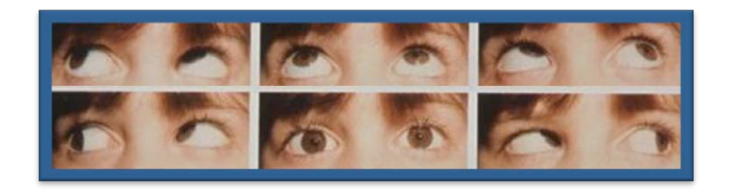
Bilateral Inferior Oblique Overaction

Even after successful surgery, periodic follow up is necessary to detect associated eye problems which may occur months, years, or decades later: Vertical misalignment of an eye, especially when looking to the side (see photo below), horizontal eye misalignment, or amblyopia. Approximately 75% of children with infantile esotropia develop inferior oblique overaction, which is best recognized when the patient looks up and in. The eye looking toward the nose elevates higher than the opposite eye. When present bilaterally, a V pattern is more likely to be present, meaning the eyes cross more in downgaze than in upgaze or they turn outward more in upgaze than downgaze. In addition to oblique muscle dysfunction, there is a tendency for one eye to drift upward and sometimes outward, a condition known as dissociated vertical deviation (DVD). This condition occurs in up to two thirds of patients with congenital esotropia. In addition, it is usually bilateral and asymmetrical.