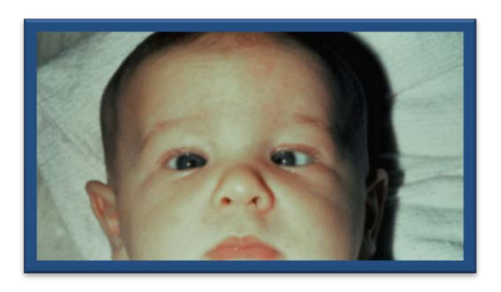
Child with Infantile Esotropia

Congenital (infantile) esotropia is a type of strabismus which appears within the first six months of life. Within the first four months of life, eye alignment may be unstable. If misalignment of the eyes persists thereafter, a consultation with a pediatric ophthalmologist is warranted. Generally, the amount of crossing, or angle of deviation, for patients with infantile esotropia is large, measuring 15 degrees or more. The amount of farsightedness or hyperopia in these children, however, is usually insignificant.