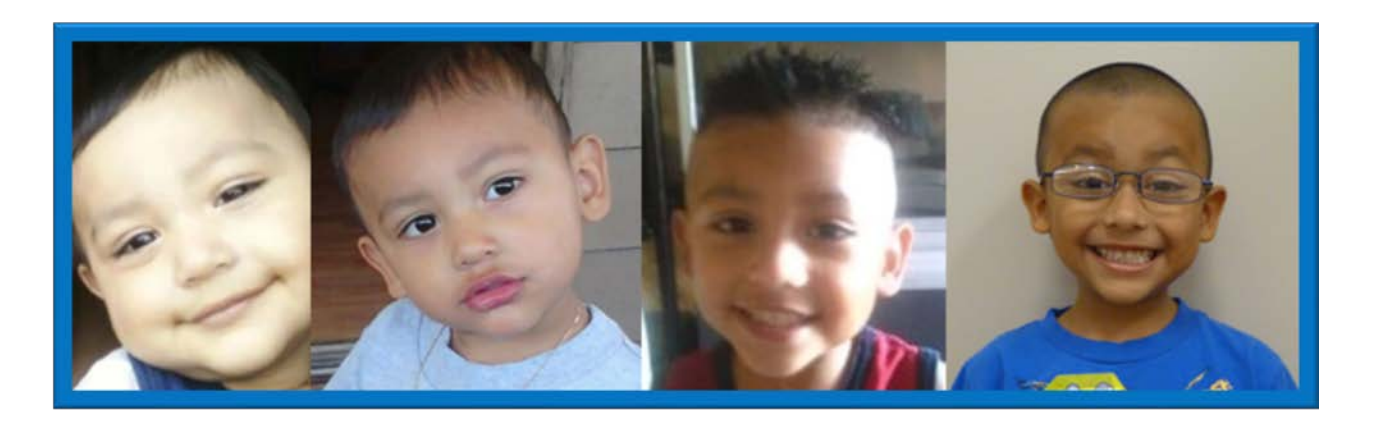
Patient with a Left Fourth Nerve (Superior Oblique) Palsy and Associated Right Head Tilt Before and After Strabismus Surgery

The two pictures on the left were taken prior to strabismus surgery and the two pictures on the right show the patient after strabismus surgery.